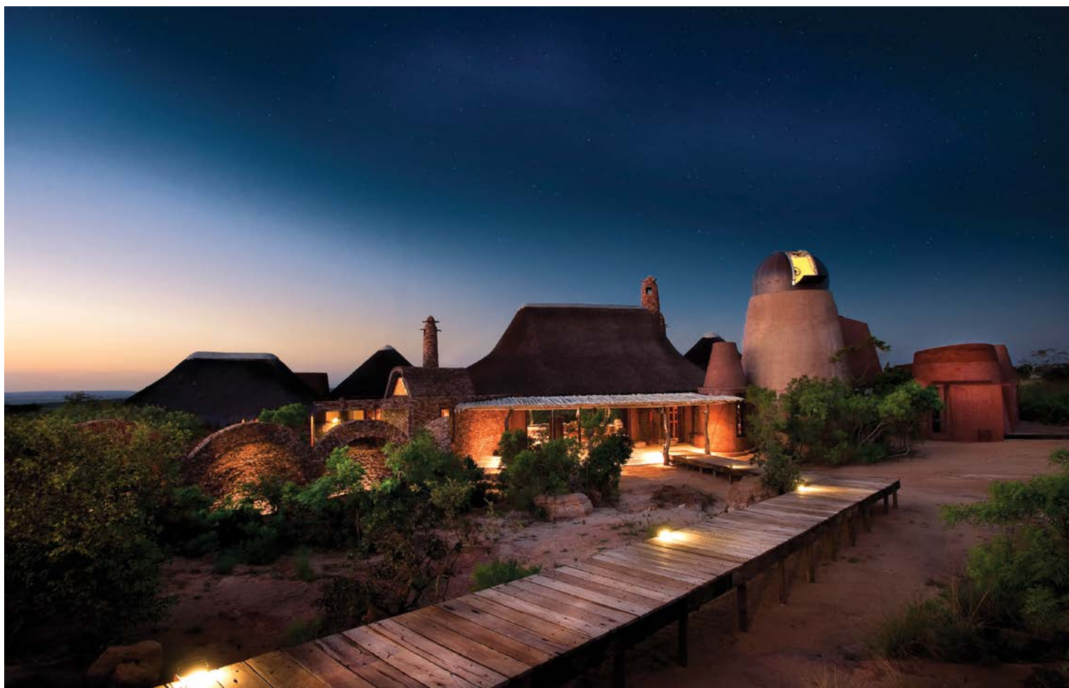
Leobo Observatory Villa, South Africa