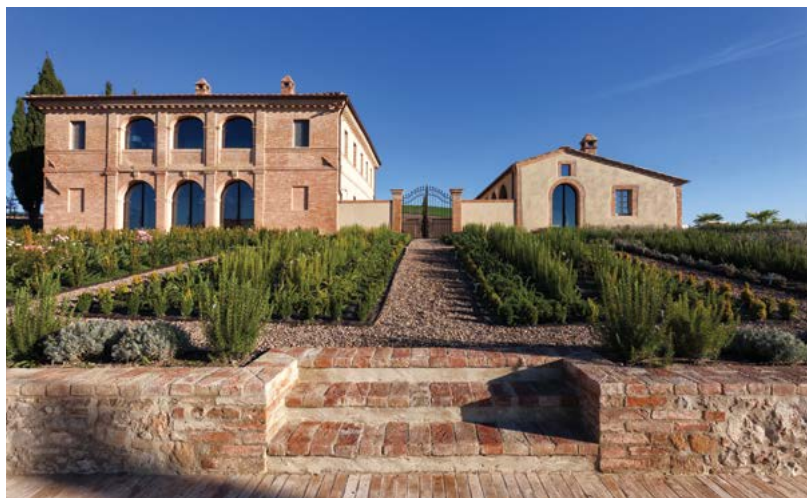
San Luigi, Italy