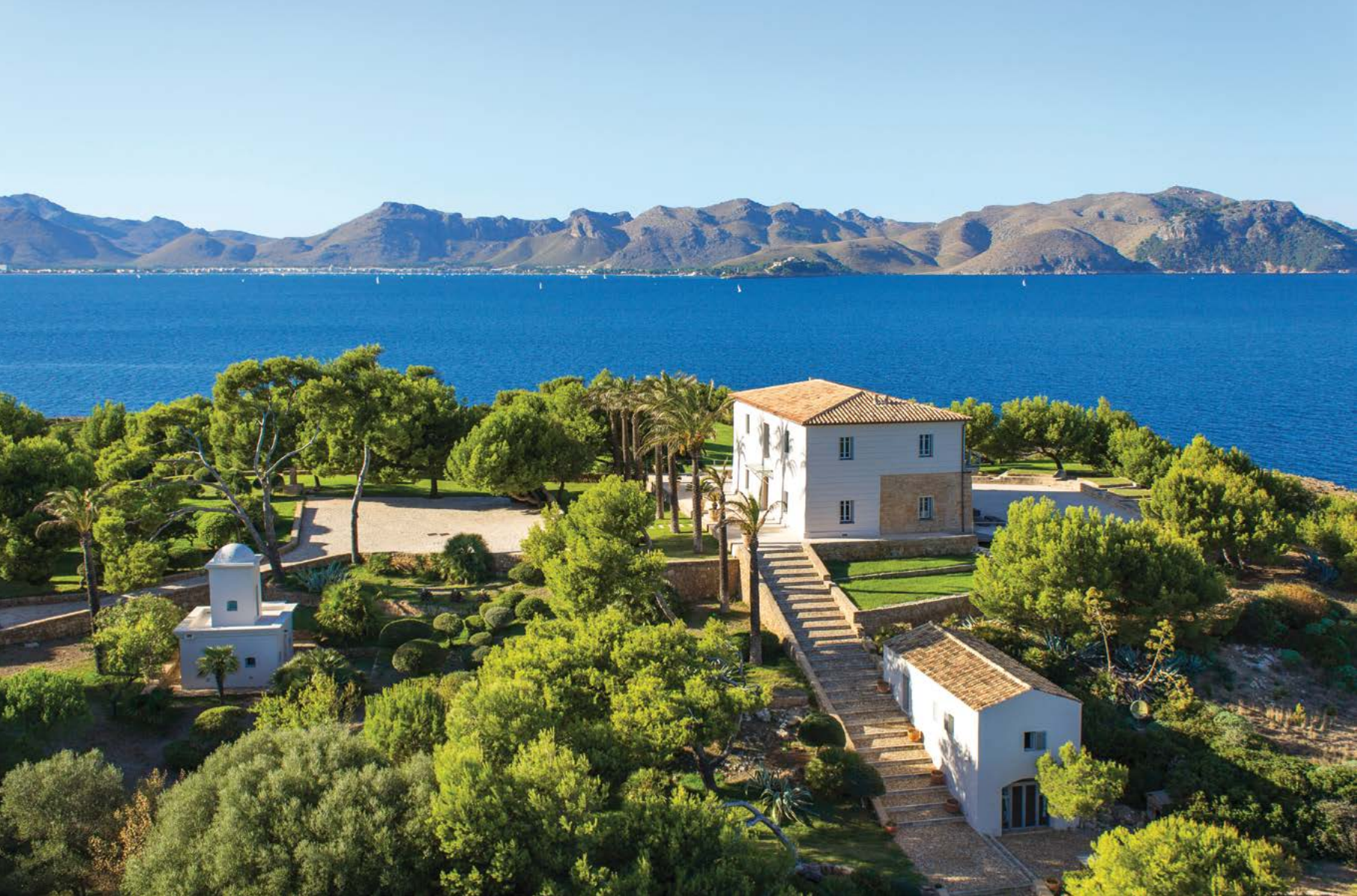
Castell de Manresa, Mallorca

Initially, our property collection was created from existing owners who recommended their friends' stunning properties. More recently, we are finding that property owners come to us through recommendations.